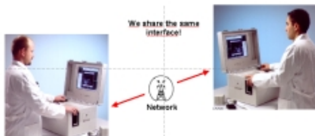
Fig 4: Sharing the "Virtual Patient"

The software part of the EU-TeleInViVo workstation is based on InViVo ScanNT® (Interactive Visualiser for Volume Data) software package [2], which has been developed over several years at Fraunhofer IGD (Fig. 5). It was mainly designed for fast and interactive visualisation of volume data and various extensions have been developed covering several other aspects of medical data visualisation. Together with the 3D ultrasound freehand scan extensions it has become a fully CE certified medical software. The main work in software development for the EU-TeleInViVo workstation is the extension of the existing 3D-ultrasound scan software to a collaborative application. This was achieved by the introduction of several communication