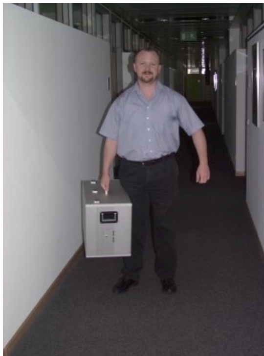
Fig 3: The portable workstation being moved

tion - the same 3D ultrasound volume data - available at his/her own application. Both can then collaboratively interact on the data and produce a common diagnosis (Fig. 4). With a battery integrated in the power supply of the system, the device can be used without external fuse as a portable emergency system.