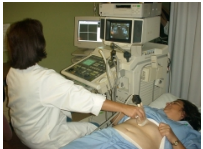
Fig 1: The fixed workstation installed in Coimbra

The system is available in two versions. The first is a fixed workstation (Fig. 1) running the EU-TeleInViVo software, which connects to an existing ultrasound scanner, equipped with a magnetic tracking system to measure the spatial position and orientation of the ultrasound probe for the creation of a 3D ultrasound data volume. The second is an integrated portable system, which combines in one solid case an ultrasound board and Intel-based PC parts connected to the ultrasound board via a frame grabber (Figs. 2 & 3).