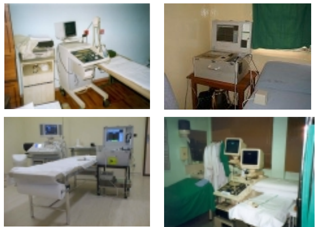
Fig 6: Installations in: Kazakhstan and Uganda (upper row), Portugal and Spain (lower row)

The University Hospital in Coimbra is coordinating the pilot medical trials of the EU-TeleInViVo system with the Hospitals of Ponta Delgada (HPD), La Laguna (Tenerife, Spain, monitored by CATAI) and Mulago Hospital (in Kampala, Uganda) and Almaty Diagnostic Centre (in Almaty, Kazakhstan) both monitored by UNESCO. In addition, secondary locations in the Canary Islands, Uganda and Kazakhstan perform local trial sessions with the principal Hospitals in these areas (Fig. 6). This is one of the first telemedicine networks worldwide (Fig. 7), covering such diverse socioeconomic, cultural and environmental domains.