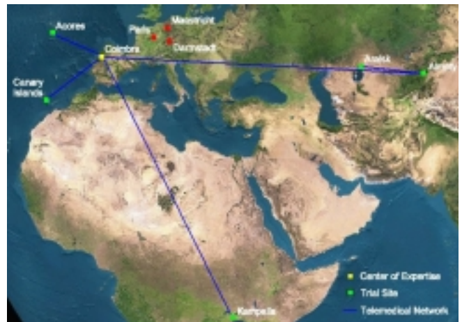
Fig 7: The geographical distribution of TeleInViVo stations

Aralsk Hospital, which is located near the Aral Sea, an area of a great ecological disaster, due to the extended and continuous drainage of the Sea. Two doctors in Aralsk conduct medical examination of patients and issue diagnoses using EU-TeleInViVo. If necessary, the data are transmitted to the Almaty Diagnostic Centre. Two physicians evaluate these diagnoses in Almaty. In case of disagreement or difficulties, the doctors in Almaty translate the diagnoses-in-question to English and request the advice of HUC. Apart from validating diagnoses for the Aralsk Hospital, the doctors in Almaty also perform an independent screening of local patients and validate the diagnoses with HUC.