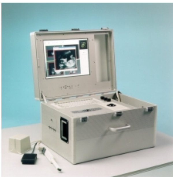
Fig. 2: The portable workstation

and an electromagnetic tracking system for recording the spatial co-ordinates of the ultrasound frames. With these two forms of information - ultrasound frames and their position and orientation in space - 3D ultrasound data sets of a patient can be reconstructed (or as engineers say "re-sampled"). This 3D data set of the patient - a "virtual patient" - is the ultrasound based information equivalent of the real patient and can be transferred to a remote site for medical diagnosis. EU-TeleInViVo stationary workstations are located in well-equipped clinics where the necessity for a portable device is rather small.